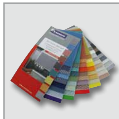
SCREEN FABRIC SAMPLES

© RENSON® Sunprotection-Screens NV, Waregem, feb. 2011