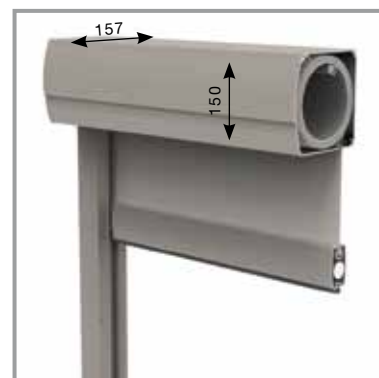
SECTION FIXSCREEN® 150 (F)