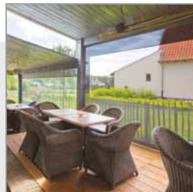
CRYSTAL WINDOW IN FIBREGLASS FABRIC